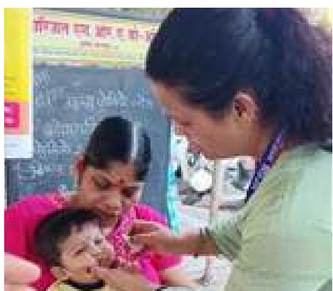
8 December 2024