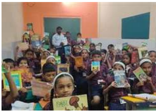
23 November 2024