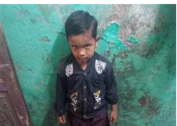
21 November 2024