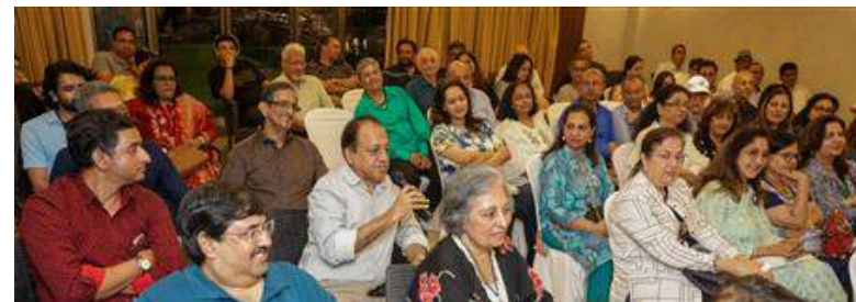
17 November 2024