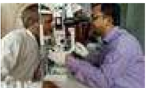
3 December 2024