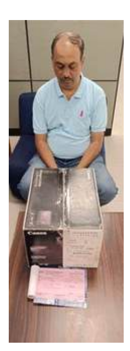
7 December 2024