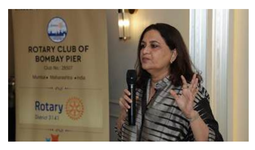
5 December 2024