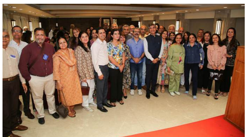
21 Novmeber 2024